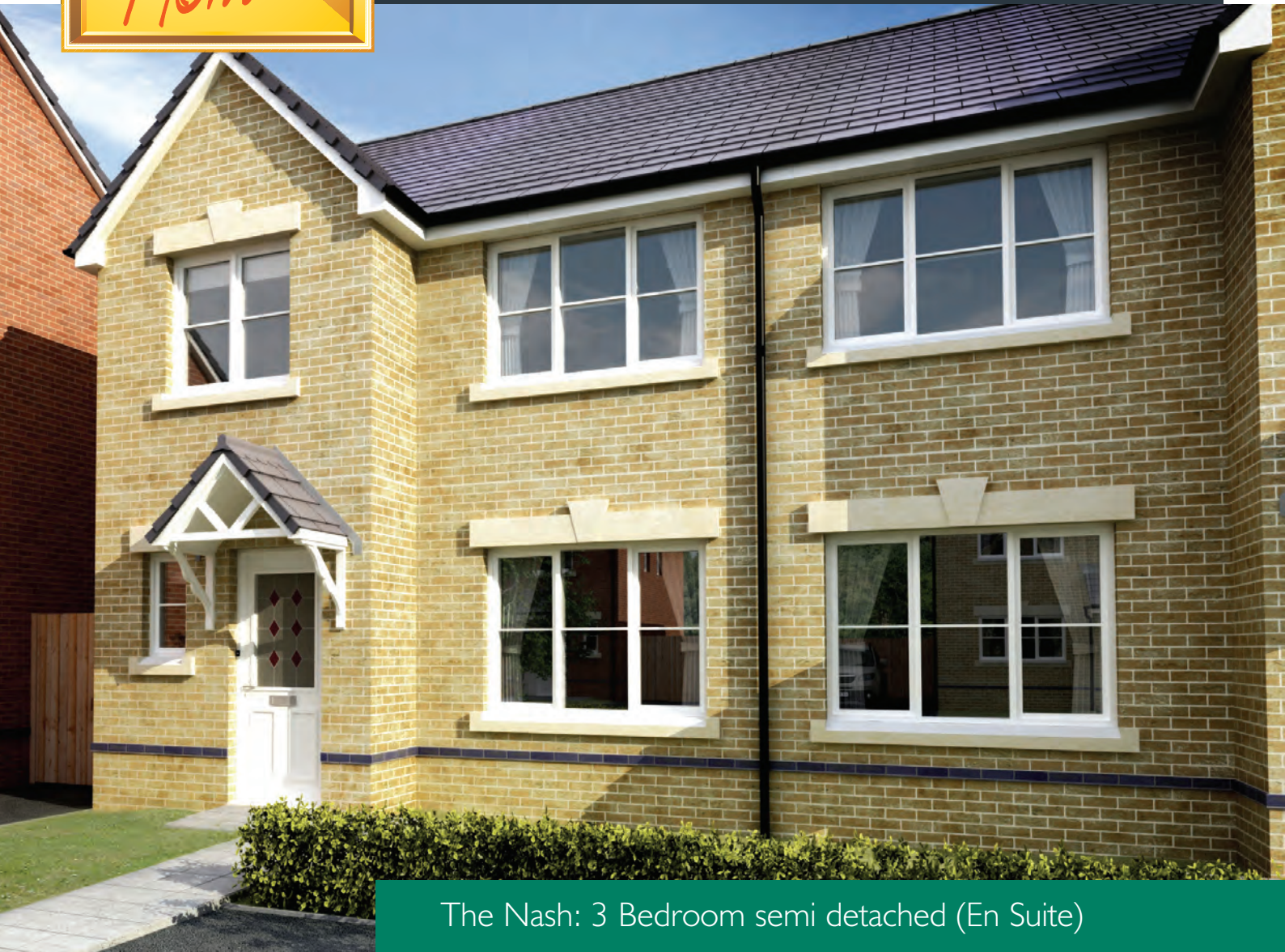
The Nash: 3 Bedroom semi detached (En Suite)