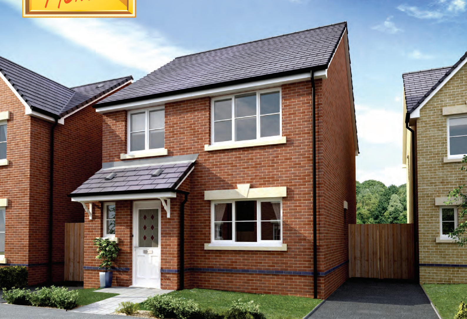
The Moulton E: 3 Bedroom detached (En suite)