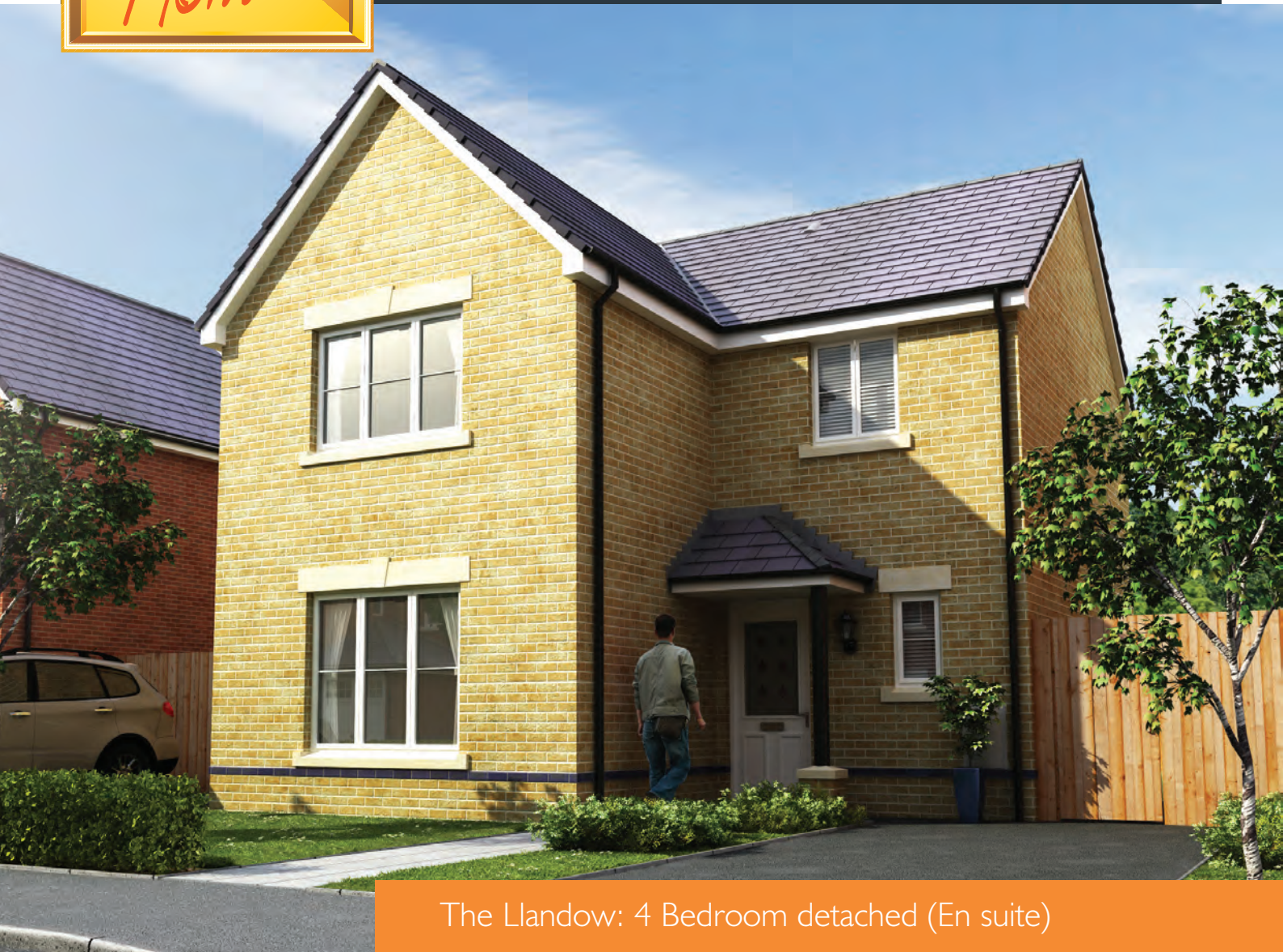
The Llandow: 4 Bedroom detached (En suite)