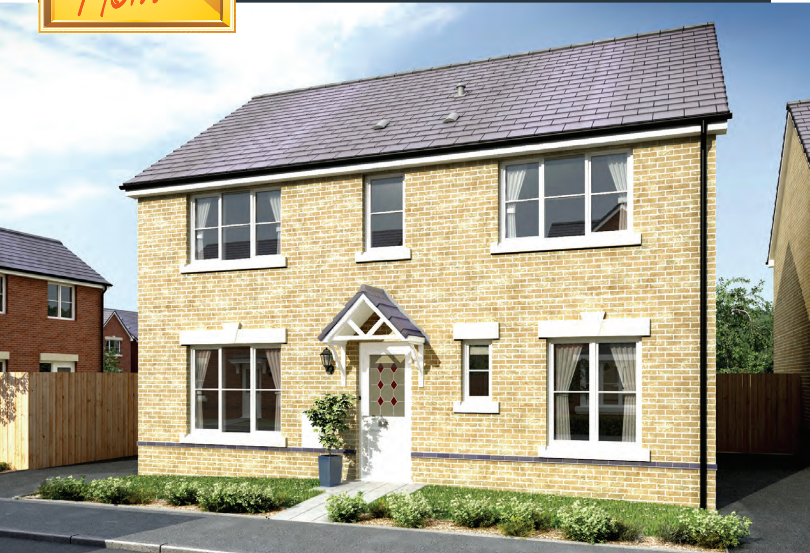
The Llancarfan: 4 Bedroom detached (En suite)