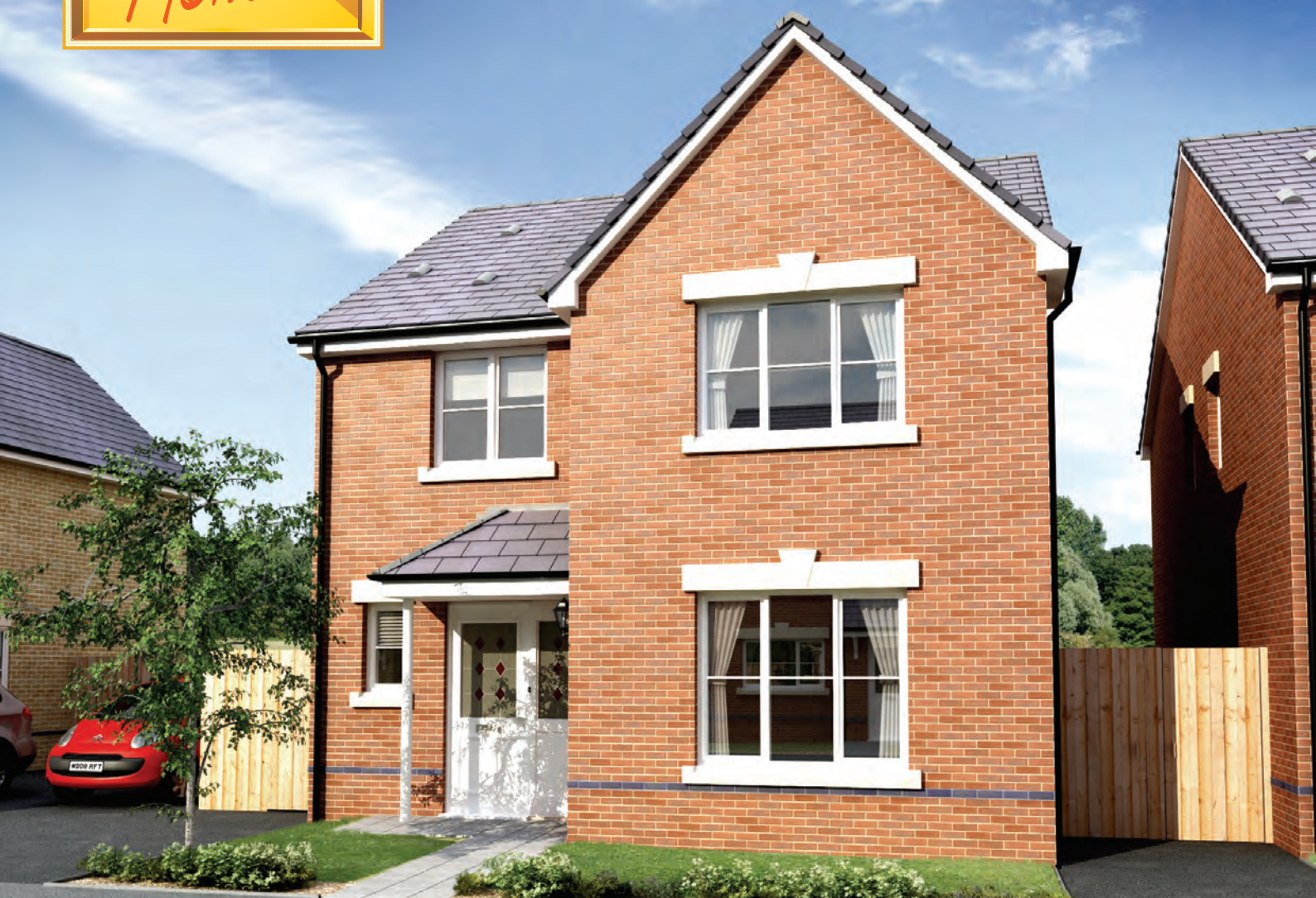
The Ferndale: 3 Bedroom detached (En suite)