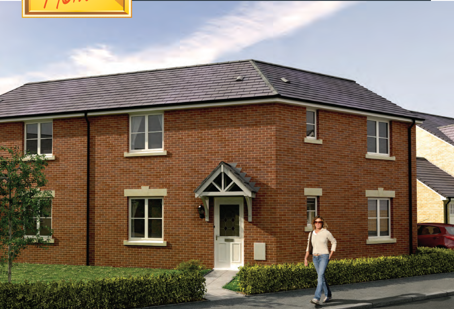
The Eweny 2: 3 Bedroom semi detached (En suite)