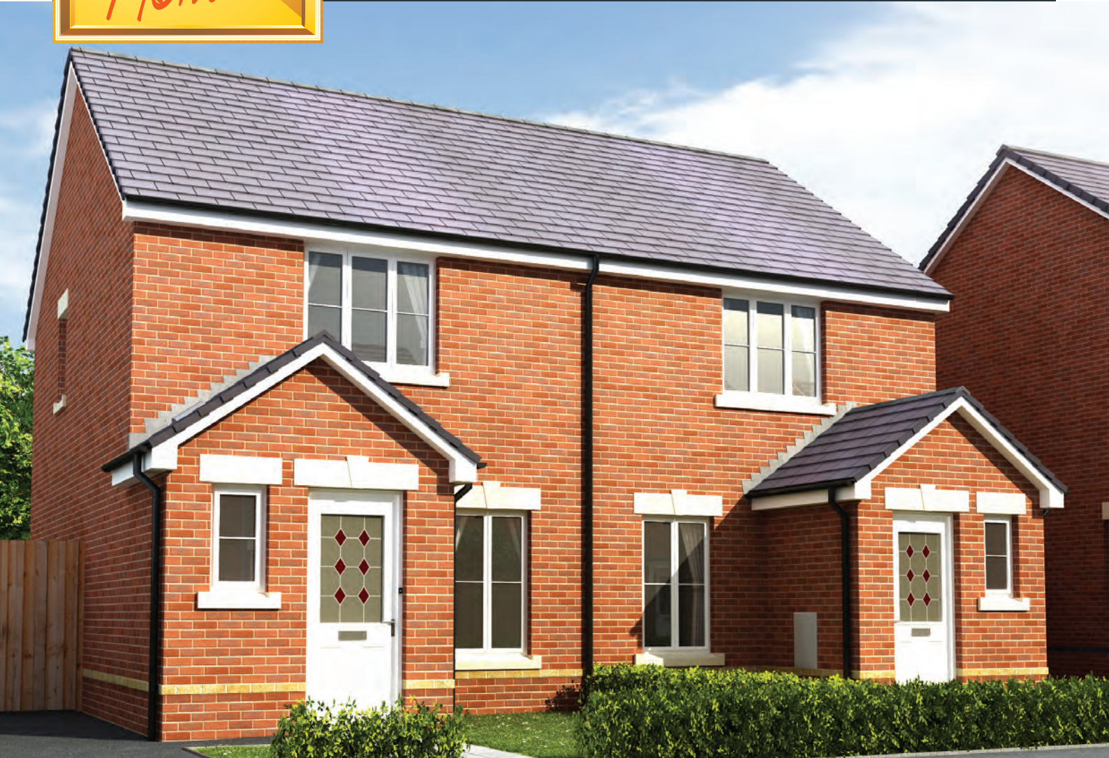
The Chelsea: 2 Bedroom semi detached & link