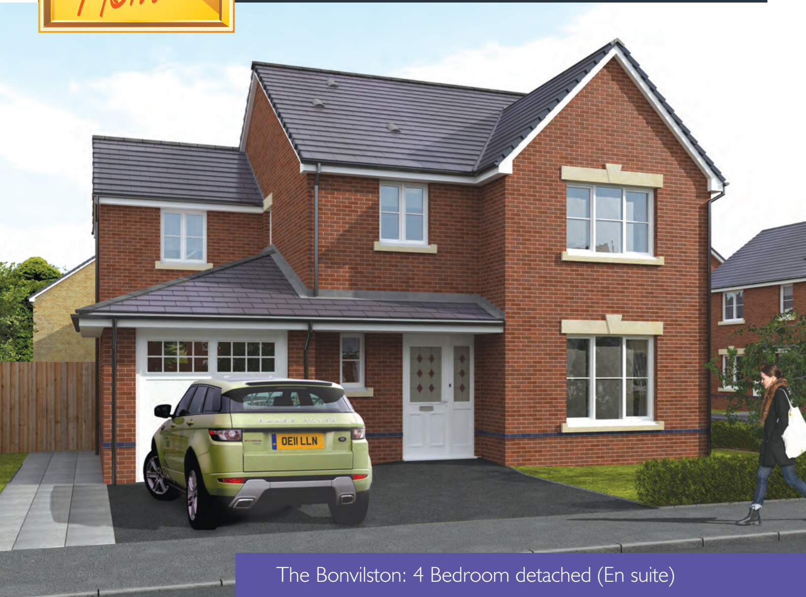
The Bonvilston: 4 Bedroom detached (En suite)